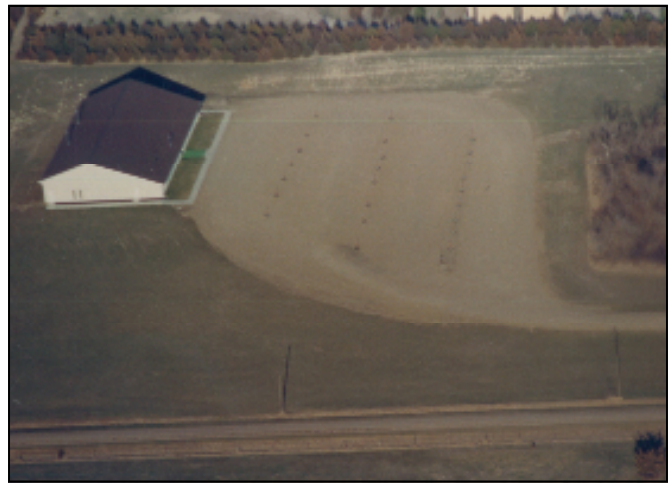
Pictures of new church building during and after construction in 1986.