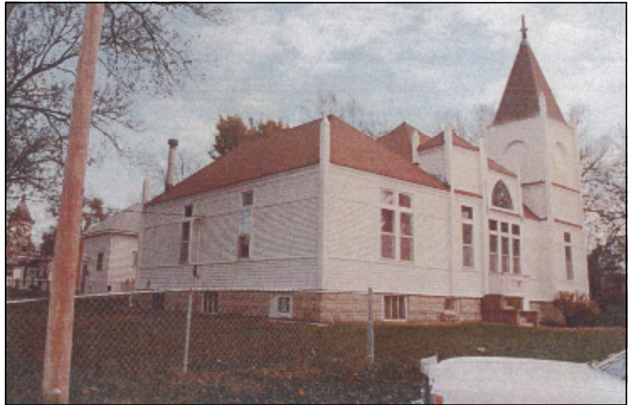
Original church building on North 10th Avenue